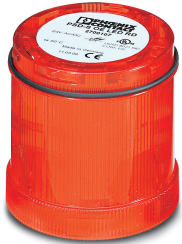
LED permanent light element, 24 V AC/DC, red

Please be informed that the data shown in this PDF Document is generated from our Online Catalog. Please find the complete data in the user's documentation. Our General Terms of Use for Downloads are valid ( http://phoenixcontact.com/download )